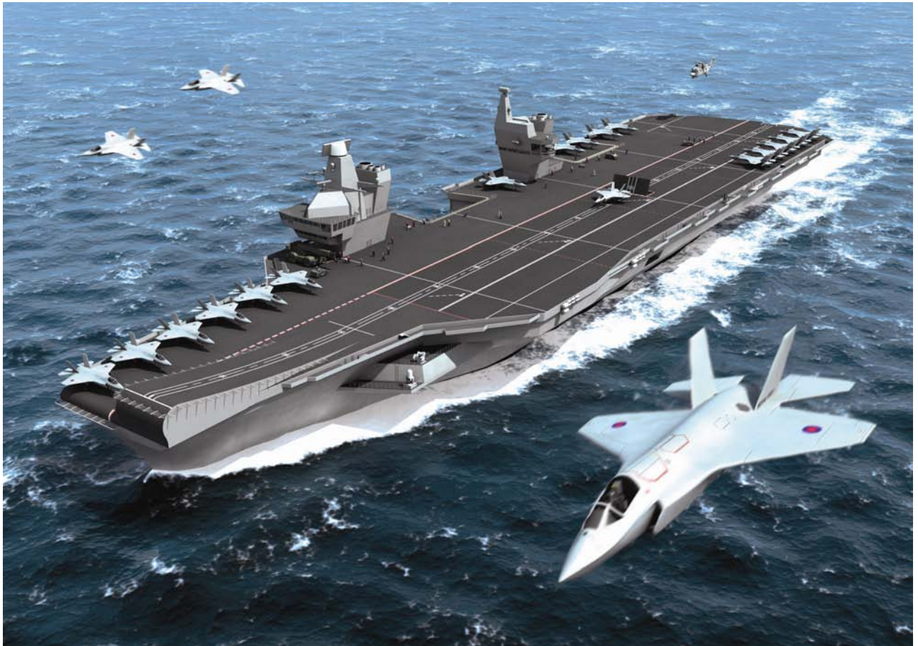
Deterrence is Primarily about Stopping High-End Threats

enough to influence the perceptions of potential adversaries regardless of their mindset. Deterrence is likely to remain effective against state actors and may also have a degree of utility against some non-state actors although it will remain impossible to deter all extremists in all circumstances. There is considerable risk that simply because deterrence does not stop all of today's threats – terrorists in particular – it may be viewed as having limited effectiveness. Deterrence is primarily about stopping high-end threats and, in their absence, it must be assumed to be effective. If it is removed the smart, adaptive adversary will simply raise his game to a higher level.