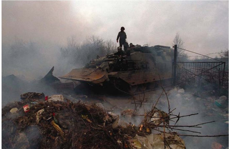
Clutter in Congested Environments

b. Cluttered. Clutter (which leads to an inability to distinguish individuals, items or events), particularly in congested environments, will provide the opportunity for concealment and will confound most Western sensors. Our adversaries (and at times ourselves) will seek to blend into the background, but locals, with their innate knowledge of their environment will hold an advantage.