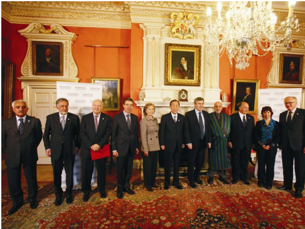
Partnerships as a Potential Strategic Edge

grow and the weight of reliance we put on partnership as a core concept should impact the choices we now make. For example, the UK could concentrate its resources on certain areas and rely on partners to provide the full spectrum of capabilities. This approach would affect the dynamic of our relationship with our partners, and particularly the US. More clearly identifying what our partners (especially the US) require of us and what we are willing to offer in return, will better allow us to focus on the practicalities of interoperability. We need to recognise better the dynamics and limitations of partnership, in the same way that we now seek to understand how deterrence operates.