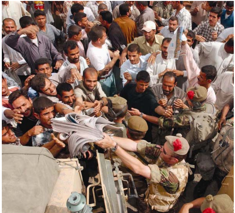
Centrality of Influence

16. The Centrality of Influence. If the character of the last military era was defined by the West's ability to conduct precision strikes on enemy platforms and command nodes, the conflicts of the future are likely to be defined more by the centrality of influence. Our adversaries have already recognised the strategic importance of influencing public perceptions and will continue to develop and use increasingly sophisticated methods. This battle of the narratives, which is not just a matter of improved public affairs, will take place in a decentralised, networked and free-market of ideas, opinions and even raw data, which will weaken the immediacy and influence of mainstream news providers. Breaking events will be increasingly transmitted directly to individuals at ever higher tempo, often without government or editorial filters, or legal sanctions and safeguards. Although the 'propaganda of the deed' is well established and